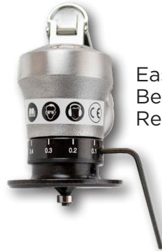
Easily Adjust Bevel Size and Replace Blades